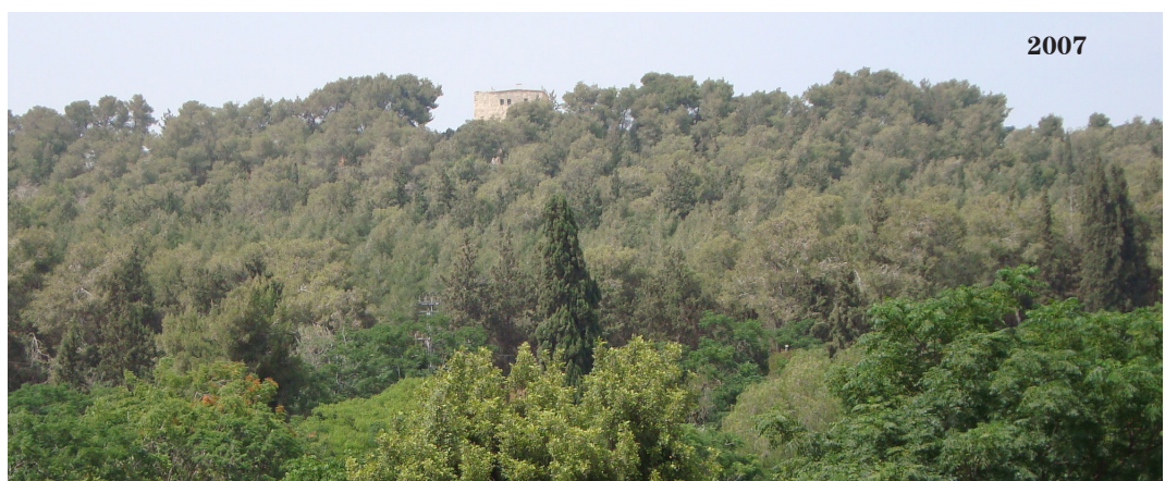
Hundreds of Palestinian villages like Saffourieh (pictured above) were planted over with trees after their residents were forced to flee in 1948, and now lay vacant.