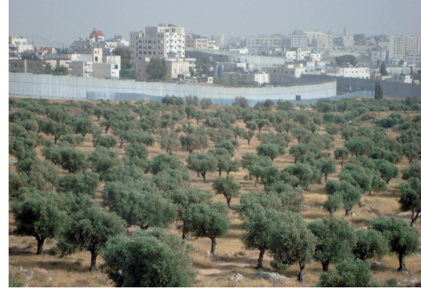
The Wall cuts through Bethlehem, leaving farmers on one side and their land on the other, begging the question: how does separating Palestinians from their trees make Israel safer?

The US government also perpetuates the conflict by preventing the United Nations from taking decisive action against Israel's crimes. A University of Cambridge study found that the US veto has ensured that Israel enjoys "virtual immunity" from the enforcement measures typically adopted by the UN against countries committing identical violations of international law.<sup>33</sup> According to President Carter: