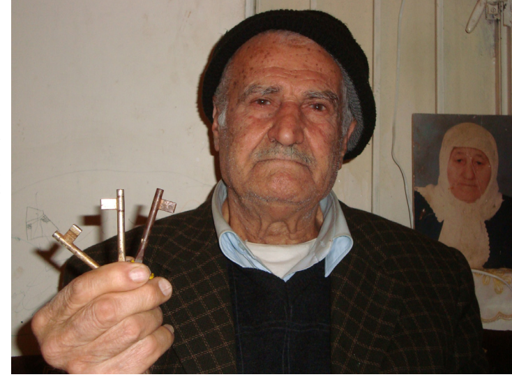
This survivor of the Nakba still holds the key to the home he was forced to flee in 1948. Even though his land remains largely empty, Israel has barred him from ever returning home because he is not Jewish.

The issue is not about space for Jews; it is about demographics and ideology. The issue is that allowing Palestinian refugees to return would alter the ethnic character of Israel.